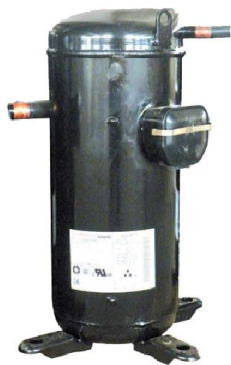
Imported scroll compressor