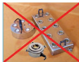
Common atomizer head