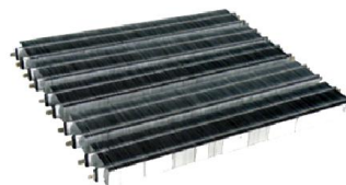
Semiconductive ceramics PTC heater