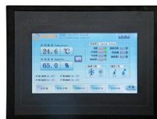
Colorful touch screen controller